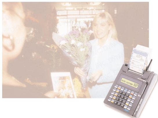
T77-S (with optional sprocket printer) in a retail environment